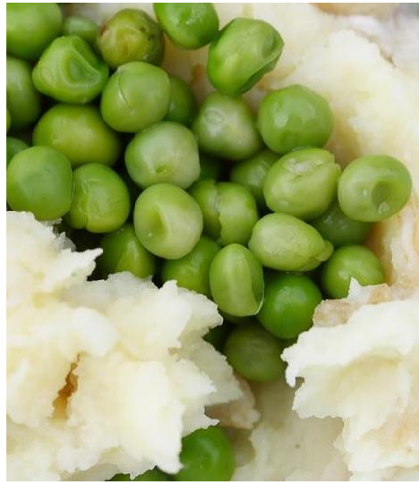
Creamed Potato & Peas