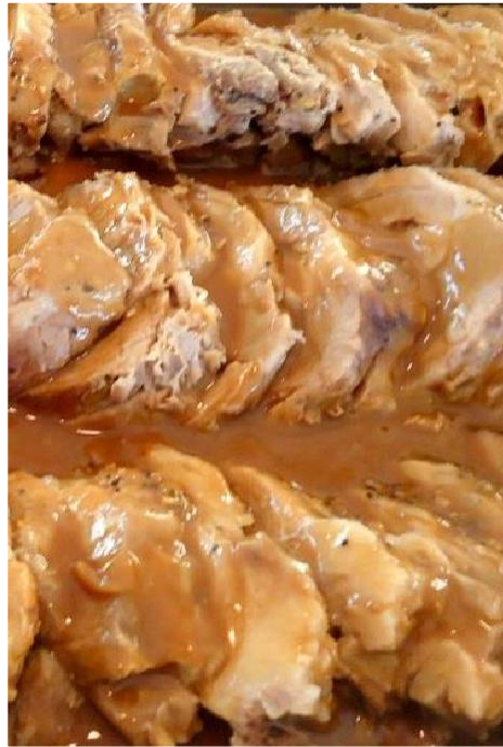
Roast Pork & Gravy