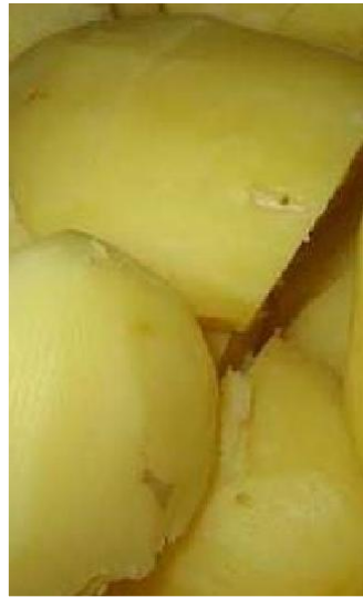
Boiled Potatoes & Carrots