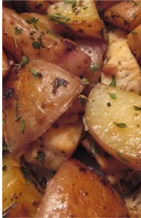
Sauté Potatoes & Plum Tomatoes