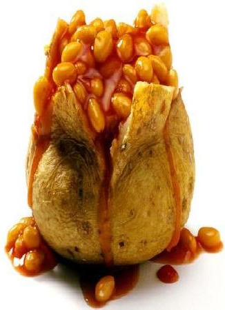
Jacket Potato & Beans