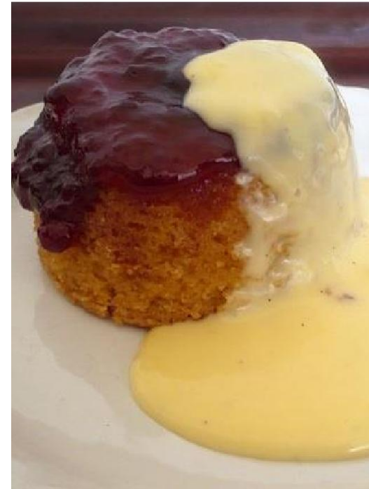
Strawberry Sponge & Custard