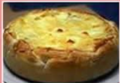
Cheese & Potato Pie