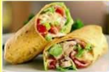
Spicy Tortilla Wraps