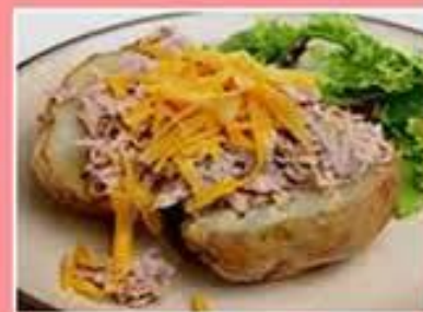
Jacket Potatoes with Cheese and Tuna