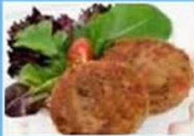
Salmon Fish Cakes