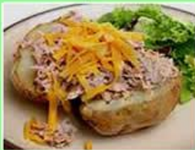
Jacket Potatoes with Cheese and Tuna