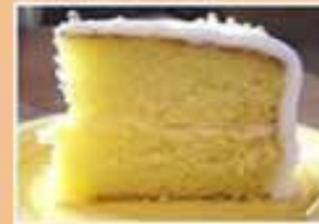
Lemon Iced Sponge