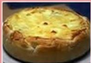
Cheese & Potato Pie