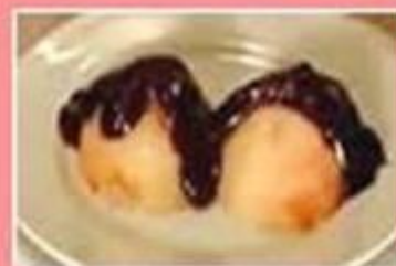
Pears and Chocolate Sauce