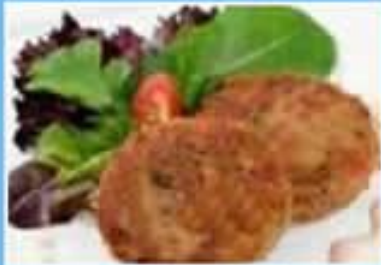
Salmon Fish Cakes