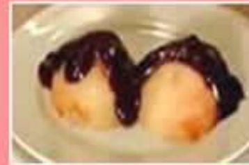
Pears and Chocolate Sauce