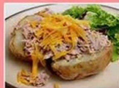
Jacket Potatoes with Cheese and Tuna