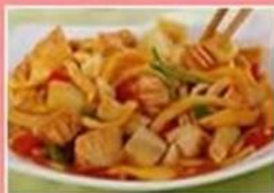
Sweet and Sour Chicken