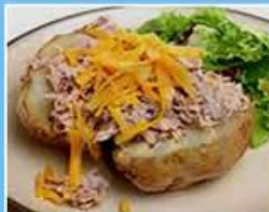
Jacket Potatoes with Cheese and Tuna