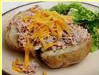
Jacket Potatoes with Cheese & Tuna