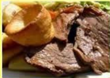
Roast Beef, Yorkshire Pudding & Gravy