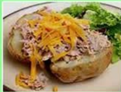
Jacket Potatoes with Cheese and Tuna