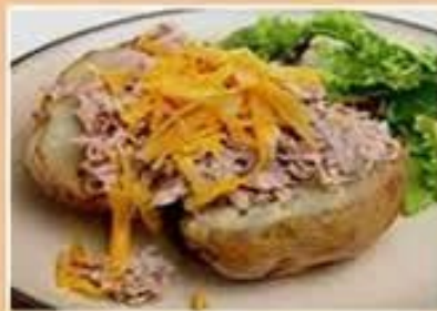
Jacket Potatoes with Cheese and Tuna