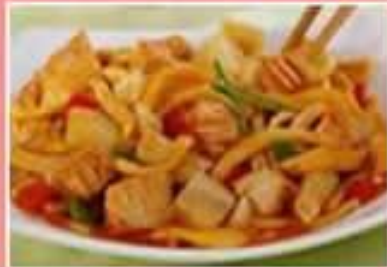
Sweet and Sour Chicken