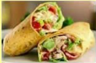
Spicy Tortilla Wraps