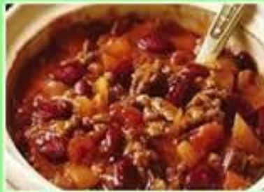
Chilli con Carne