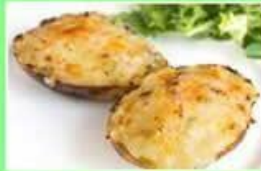
Half Loaded Jackets