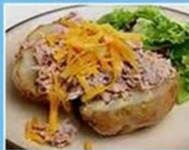
Jacket Potatoes with Cheese and Tuna