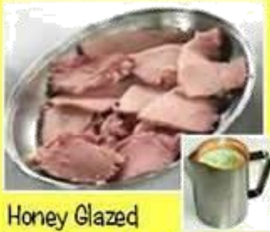
Honey Glazed Gammon & Parsley sauce