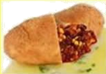
Kidney Bean Kievs