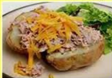
Jacket Potatoes with Cheese & Tuna