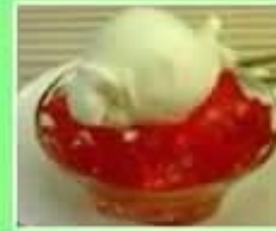
Jelly and Ice cream