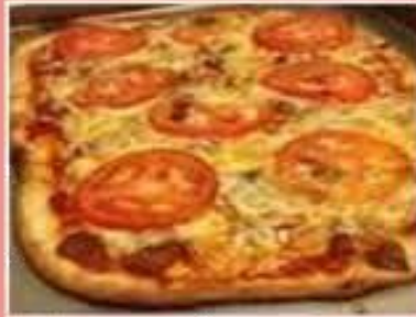
Cheese & Tomato Pizza