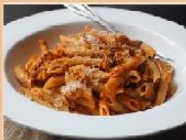
Tuna Tomato Bake