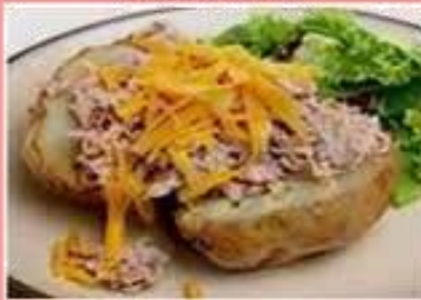
Jacket Potatoes with Cheese and Tuna