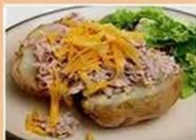
Jacket Potatoes with Cheese and Tuna