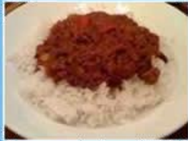
Chilli con Carne