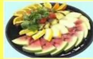
Fresh Fruit Platter