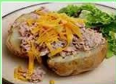
Jacket Potatoes with Cheese and Tuna