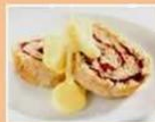
Jam Roly Poly & Custard