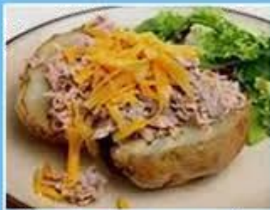
Jacket Potatoes with Cheese and Tuna