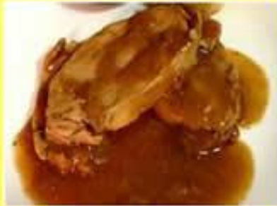
Roast Pork & Gravy