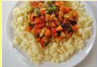
Vegetable Curry & Rice