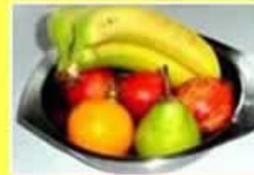
Fresh Fruit Bar