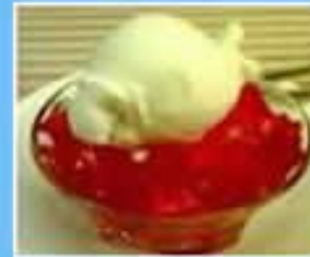
Jelly & Ice-cream