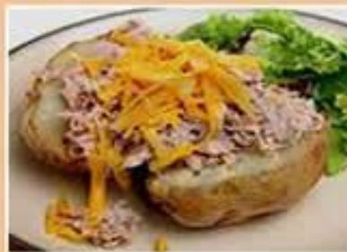
Jacket Potatoes: Cheese and Tuna