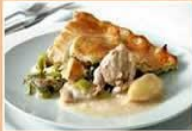
Chicken and Leek Pie