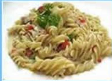
Tuna Pasta Bake