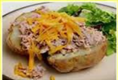
Jacket Potatoes: Cheese & Tuna