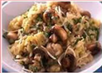
Bacon and Mushroom Risotto with Cheese -