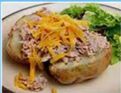
Jacket Potatoes with Cheese and Tuna