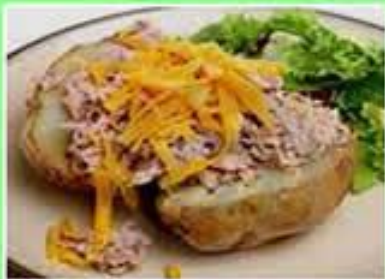
Jacket Potatoes with Cheese and Tuna