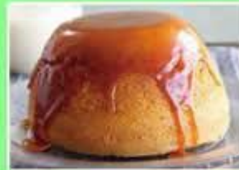
Goosey Orange Pudding & Hot Orange Sauce