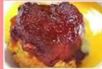
Strawberry Sponge and Custard