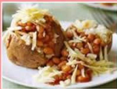
Jacket Potatoes: Cheese, Tuna and Beans